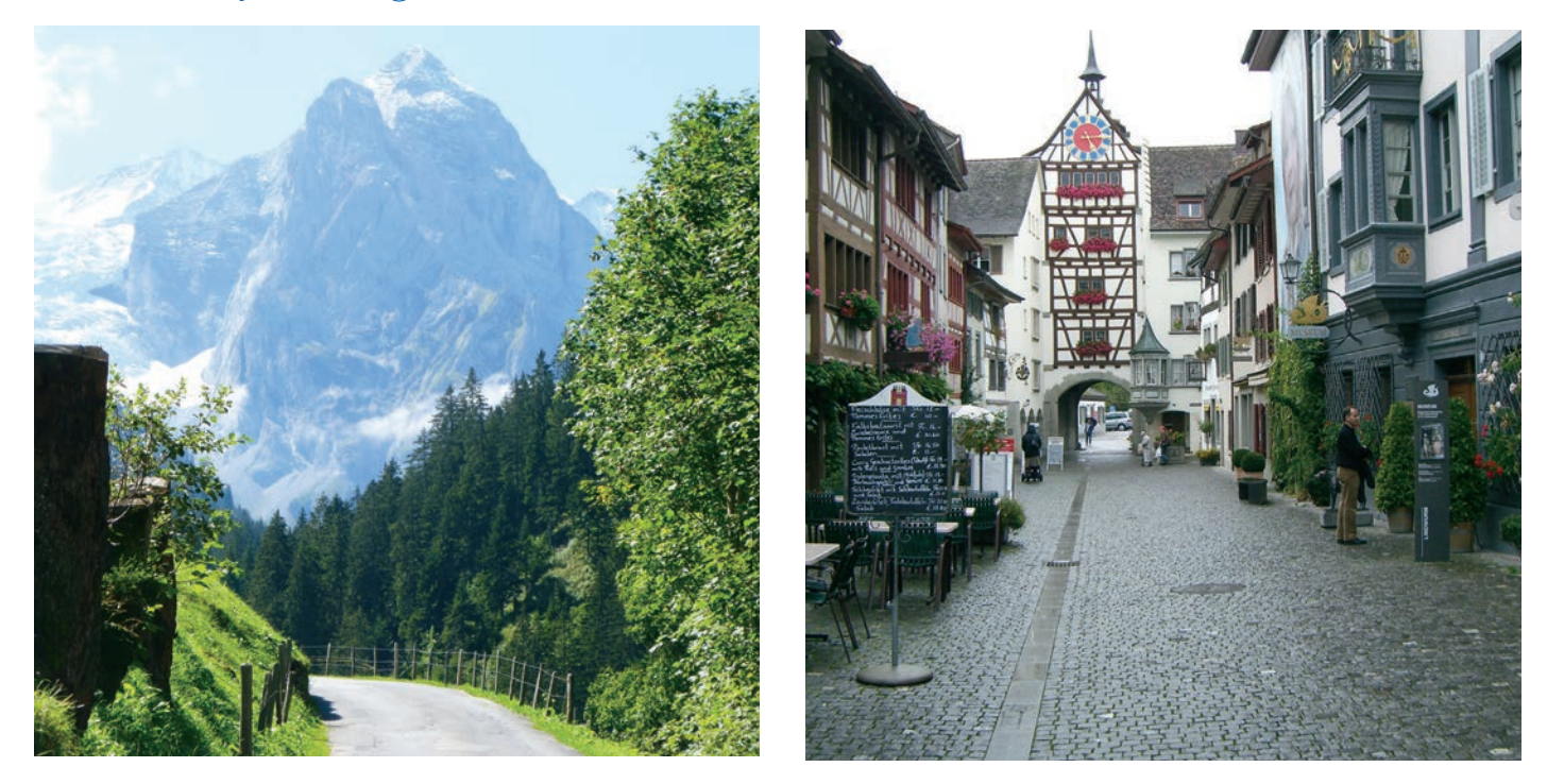
* The paraglider on the front cover is Wayne Barton.